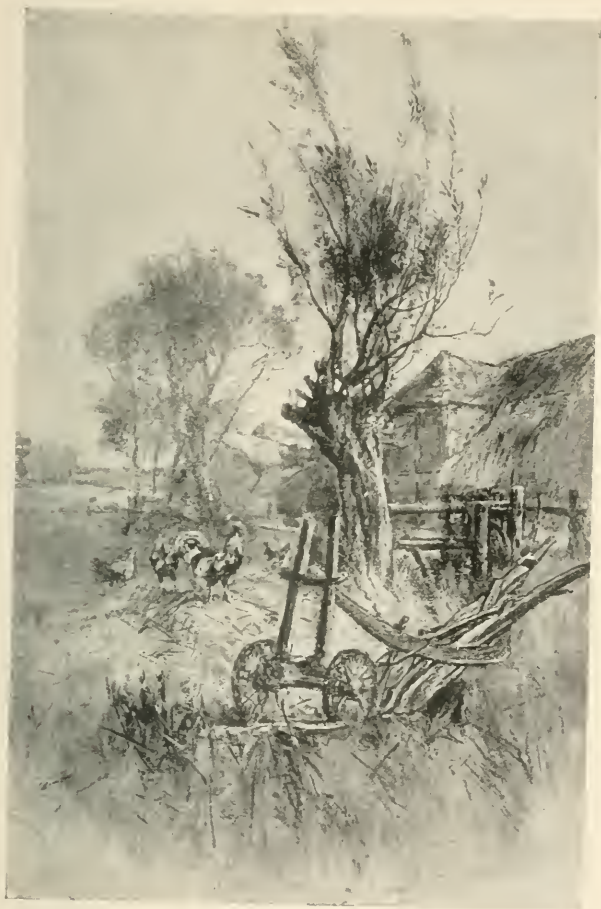
The cock's shrill canon